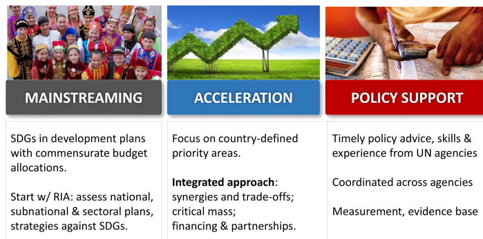
[Figure 2] MAPs (Mainstreaming, Acceleration, Policy Support)

What does UNDP do to support SDG implementation? MAPs (Mainstreaming, Acceleration, and Policy Support) is UNDP's practical contribution toward SDG attainment funded by the Republic of Korea. UNDP takes a team of experts, goes to a country for examining the problem, and provides policy supports.