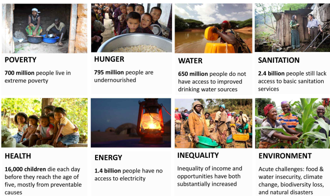
© UNDP – 'Getting ready to implement the 2030 Agenda'